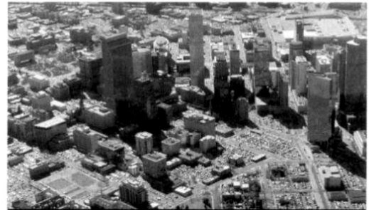
DOWNTOWN WILL NEVER LOOK THE SAME AGAIN ONCE YOU HAVE SEEN IT FROM THE COCKPIT OF A CESSNA.

Of the 400 students enrolled with McAir, about half are career aviators and half are recreational enthusiasts. Both sets of students