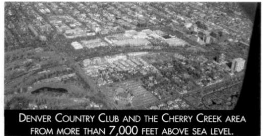
DENVER COUNTRY CLUB AND THE CHERRY CREEK AREA FROM MORE THAN 7,000 FEET ABOVE SEA LEVEL.

are learning side-by-side in classroom-based training, as well as in the state-of-the-art, quarter million dollar flight simulator. Facilitating the learning process are the incredibly sophisticated resources of Cessna's computer-based instruction system. The entire ground school program can be completed via CD-ROM interfaces tied to the McAir servers.